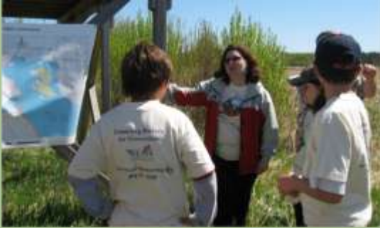
Biodiversity Day brought elementary schools to Central Algoma Secondary School to learn about wetlands and the impact humans have

2009 saw us partnering in the community on many projects